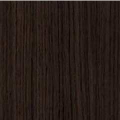
Walnut Similar to Ebony Recon Wilsonart 7997-38