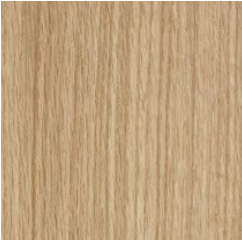
Rift Cut Oak Clear Coat