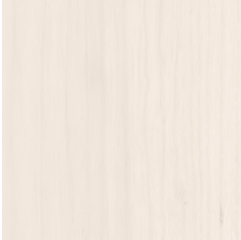
Ash* – Light Gray Stain