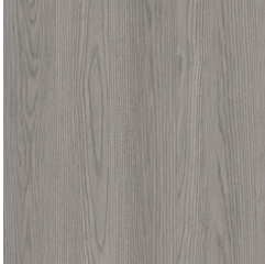
Ash* – Dark Gray Stain