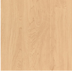
Maple Similar to Kensington Maple Wilsonart 10776-60