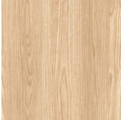
Ash* – Clear Coat

*Ash species color and grain variation is significant, ranging from blonde in color to darker. This affects clear coat and stained products. Be aware that the natural variation may be visible within products or from product-to-product.