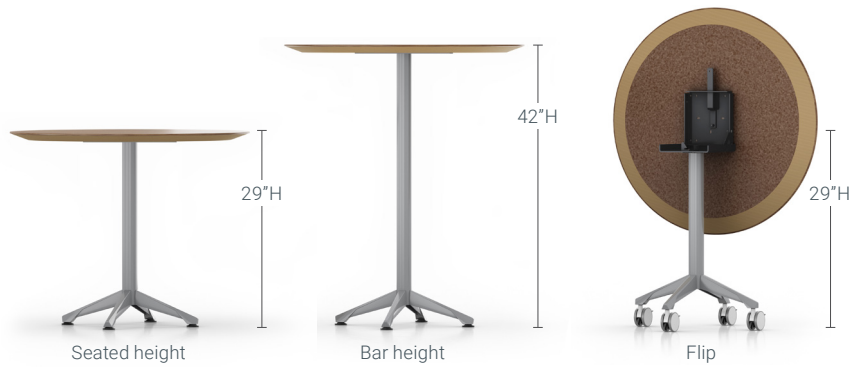
X-Base 24", 30", 36", 42" Round tops 24", 30", 36" Square tops