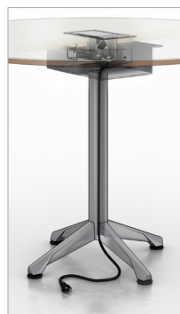
Bases with power data top plate route cables through the column and out the bottom of the vertical column.