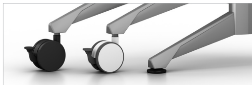
Foot options include levelers, or locking casters in black or white with grey trim.