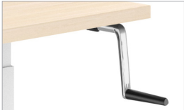
Telescoping Crank Handle tucks beneath worksurface while inactive and pulls out toward user for easy use.