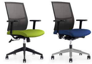
Simple Task MZ11