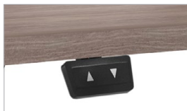
Up/Down Controller (standard)