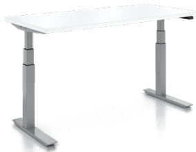
2-Leg Extended Range

Depths 24", 30" Widths 48" to 72" (adjustable crossbars) Range 24" to 49.5"