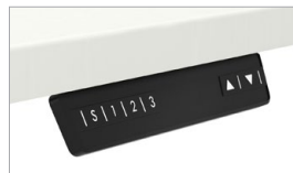
Programmable Controller (optional)