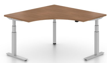
3-Leg Extended Range

Depths 24", 30" Widths 36" to 72" Range 24" to 49.5"