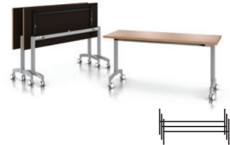
Straight T-Leg (Off-Set Nesting)