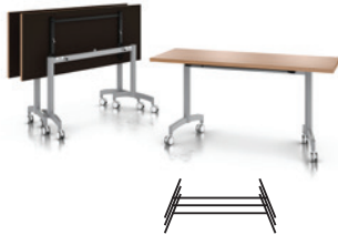
Angled T-Leg (In-Line Nesting)