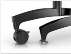
Foot options include levelers, or locking casters in black or white with grey trim.

Depth 18", 24", 30" Width 48", 60", 72", 96"