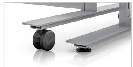
Casters or Leveler Feet Options