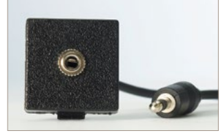
3.5mm stereo plug