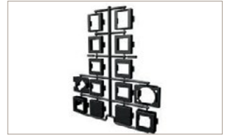
Included with power/data assembly