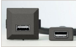
USB-A data transfer cord