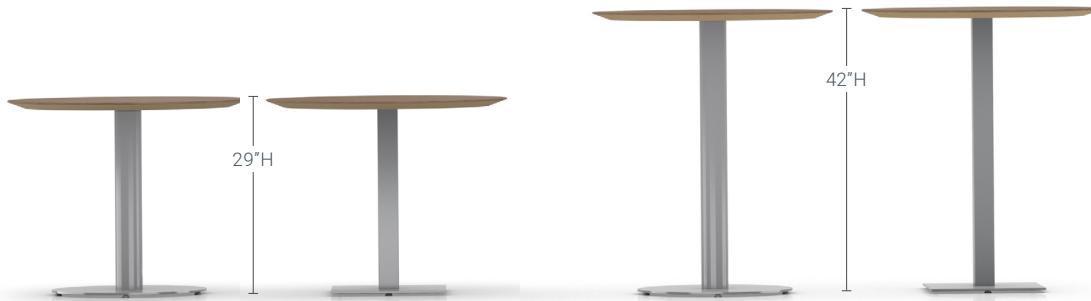
Dining Height 29"H / 29.5"H with Levelers (Includes 1.25" top)