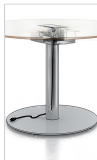
Bases with power data top plate route cables through the column and out the bottom of the vertical column.